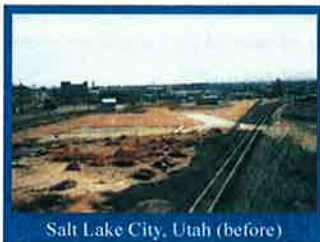
Salt Lake City, Utah (before)

The U.S. Environmental Protection Agency's (EPA) Brownfields Program is designed to empower states, communities, and other stakeholders to work together in