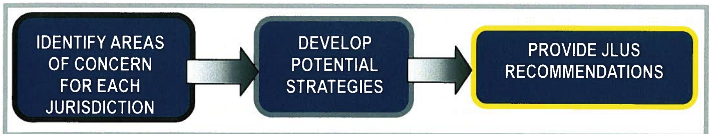
Figure ES-1: JLUS Approach Simplified

As of the end of August 2011, there have been 14 meetings including seven Policy Committee Meetings, five Technical Working Group (TWG) Meetings, and two Public Information Meetings to help engage the public in the JLUS process. The following provides a list of meetings for the NASL JLUS where the JLUS was the only purpose of the meeting.