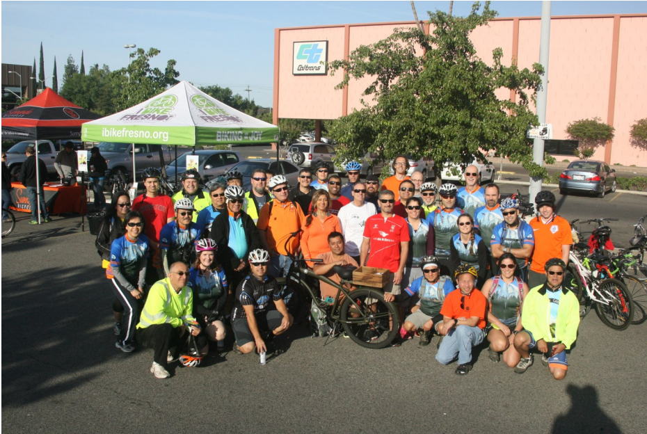
Bike to Work Champions May 2015

Last May, as part of National Bike Month, Caltrans District 6 participated in the Bike to Work Corporate Challenge, sponsored by iBikeFresno.org. Event participants included local agencies and businesses in the Fresno area. Caltrans District 6 has had a large number of riders compete in this annual event and has placed first in the large corporation category a number of times. Other fun rides are organized throughout the month of May.