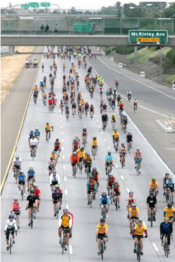
California Classic Century Ride Saturday, May 16, 2015

The Guide also includes a Complete Streets component, with information on pedestrian, transit, and non-roadway modes access. A complete street provides for the needs of travelers of all ages and abilities in all planning, programming, design, construction, operations, and maintenance activities and products on the State highway system. A Complete Street views all transportation improvements as opportunities to improve safety, access, and mobility for all travelers and recognizes bicycle, pedestrian, and transit modes as integral elements of the transportation system.