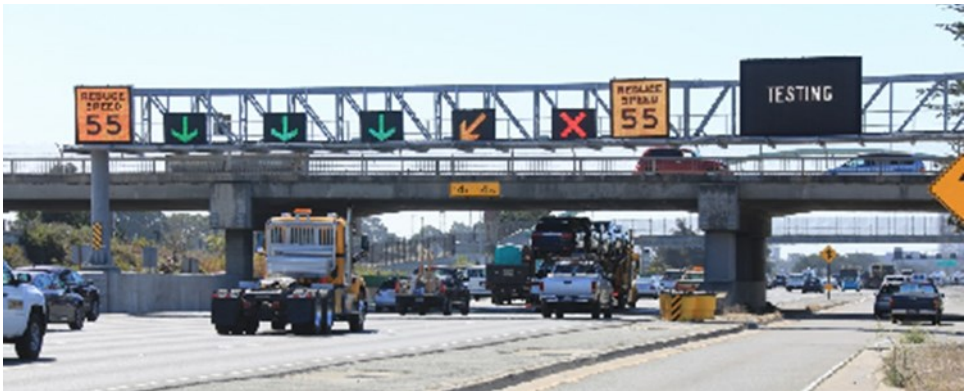
Above and right: The I-80 Smart Corridor in the Bay Area is undergoing testing and is expected to go live early next year.

Connected Vehicles – V2V is shorthand for vehicle-to-vehicle communications. All vehicles will be required by the National Highway Traffic Safety Administration (NHTSA) to have DRSC, or dedicated short-range communications, to communicate to each other. Phase-in is expected to begin within 5 years. Vehicles with DRSC will be transmitting a Basic Safety Message, which includes vehicle heading, speed, and location. Numerous applications for V2V are envisioned, including Left Turn Assist (LTA) and Intersection Movement Assist (IMA). LTA would warn a driver when it is not safe to turn left in front of an oncoming vehicle, and IMA would warn a driver when there is a high probability of a collision when entering into an intersection. DRSC will also be used for communications for vehicles to infrastructure, or V2I. For instance, traffic signals can transmit signal indication and timing information to vehicles. Such information is already available using a phone application in some cities, such as Walnut Creek.