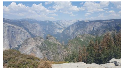
View from Dewey Point, Yosemite National Park

On August 25, 1916, President Woodrow Wilson signed the Organic Act into law, creating the National Park Service. Today, the National Park Service is responsible for more than 400 park locations, which cover more than 84 million acres in all 50 states, the District of Columbia, American Samoa, Guam, Puerto Rico, Saipan, and the Virgin Islands. When it was first created, the new bureau was responsible for protecting America's 35 already-existing national parks and monuments, and those yet to be established. For more, click on Turning 100: Major Milestones in the National Park Service .