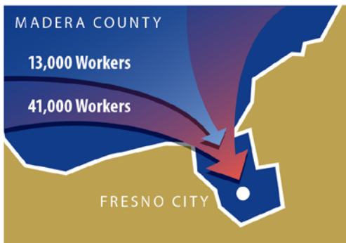
MADERA COUNTY COMMUTERS TO CITY OF FRESNO