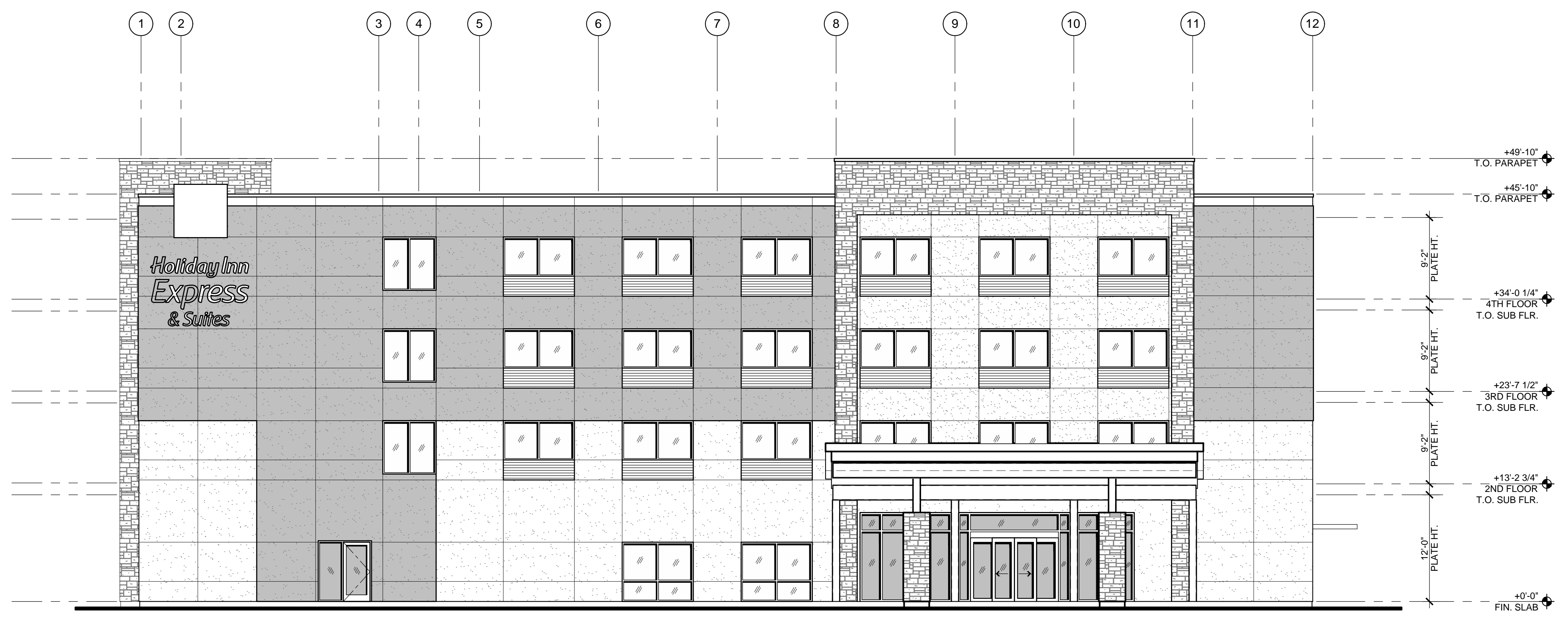
SOUTH ELEVATION MCKINLEY AVE. STREET ELEVATION