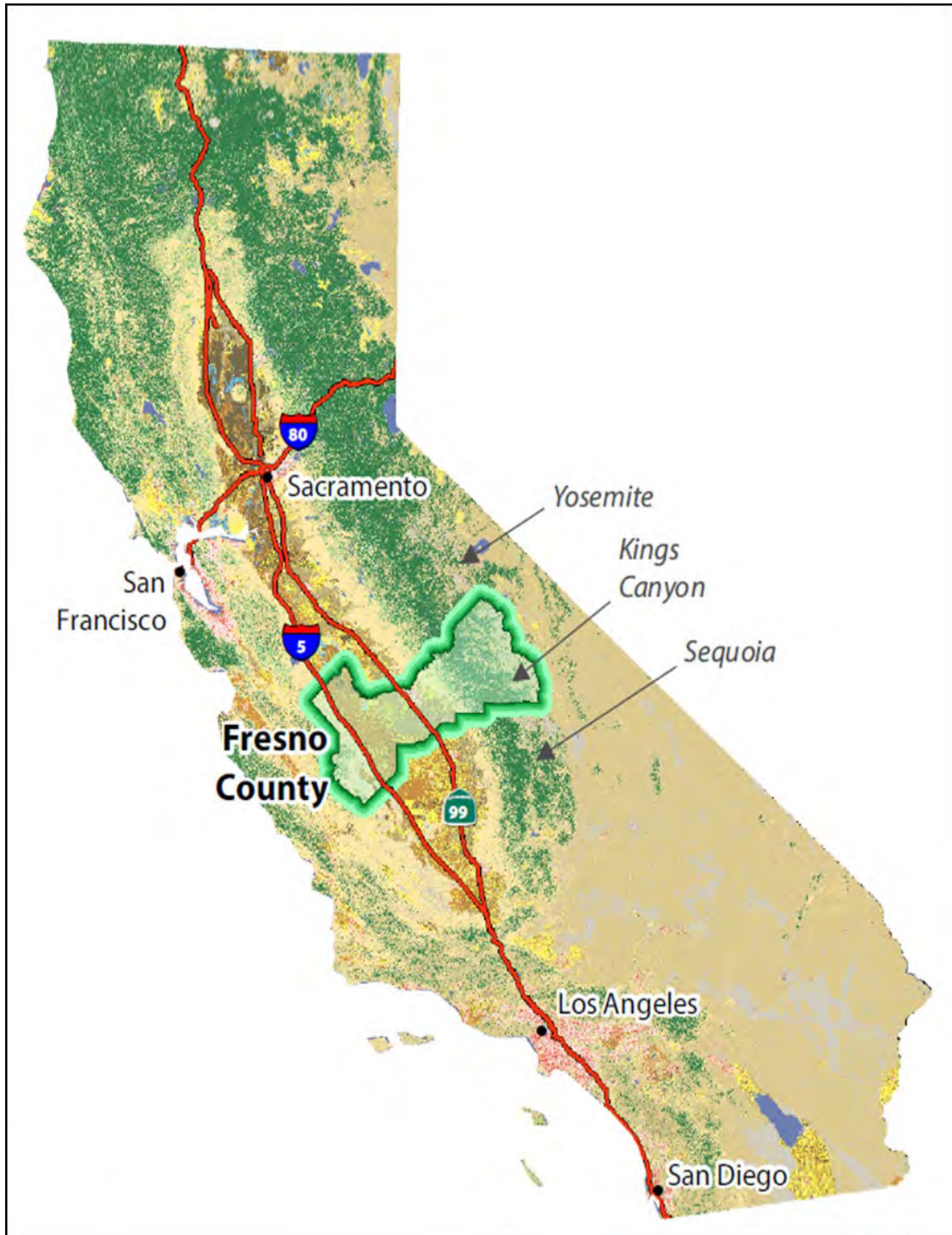
FIGURE A-1 Location of Fresno County